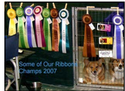
Some of Our Ribbons Champs 2007