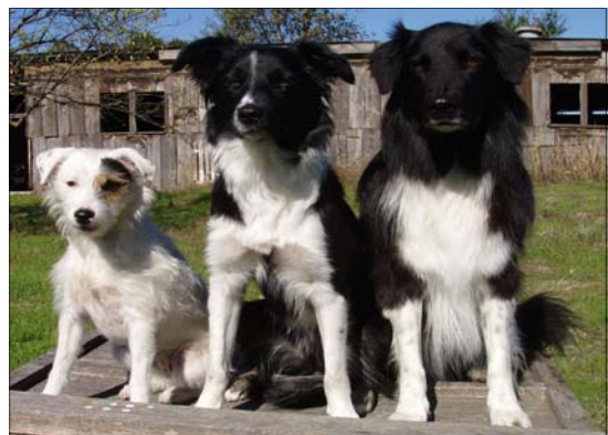
Gadget, Kachina Doll & Gizmo.